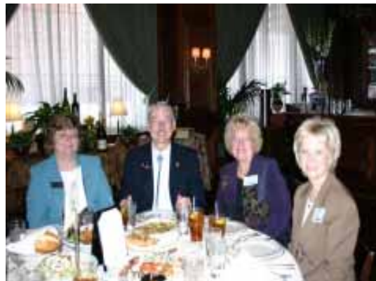
Hungry legislators and members